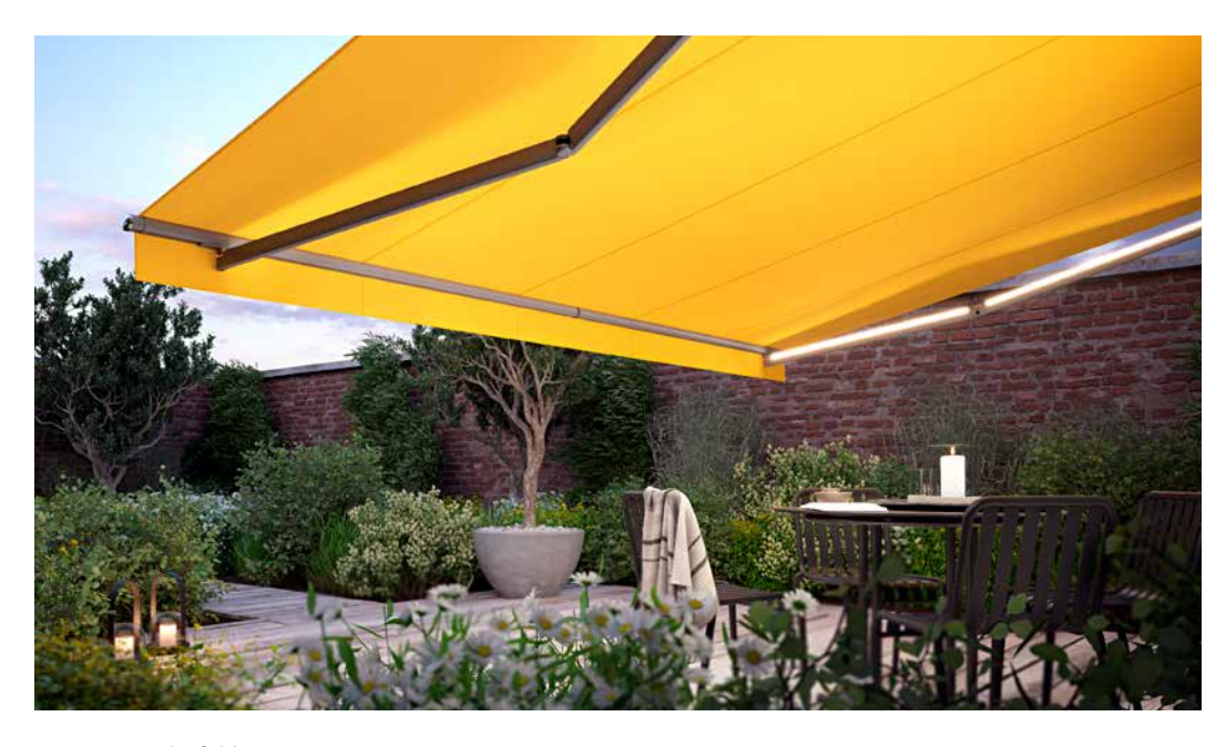
LED Lines in the folding arms