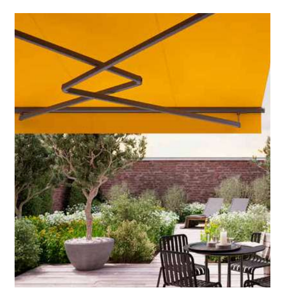
markilux 1710 stretch

Gives an impressive performance on narrow patios, balconies and in recesses: thanks to the two crossover arms even awnings with a narrow width are able to extend considerably further.